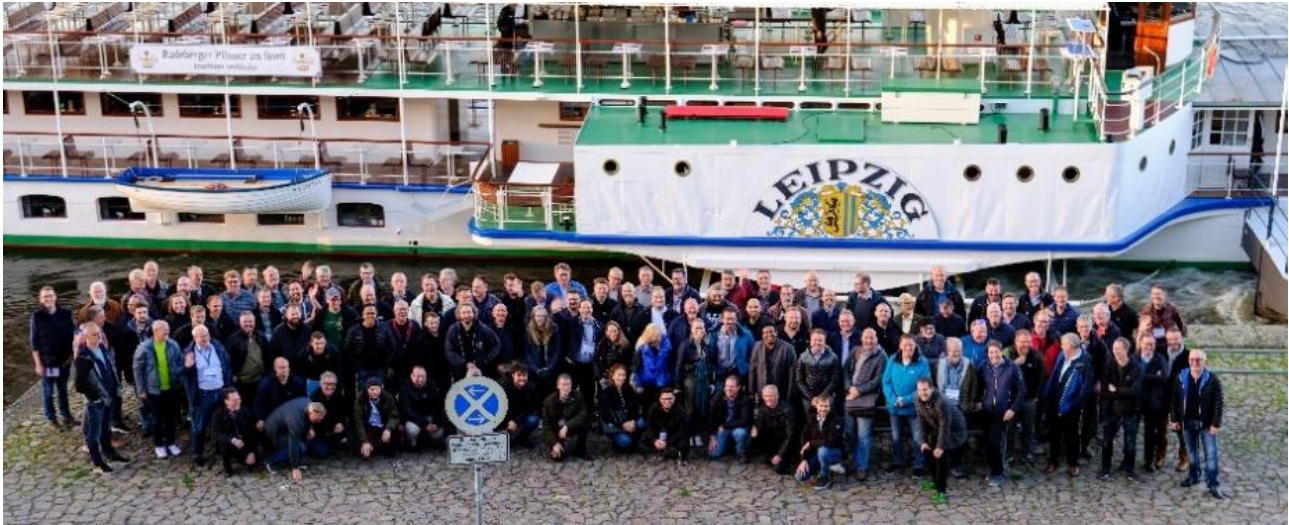
Group attending the GSE ISP Symposium 2022

The IBM Spectrum Protect Symposium is organized every 2 years.