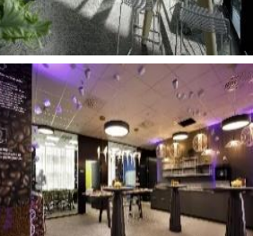
IBM Client Center Oslo